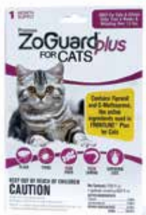
51116 ZoGuard Plus for Cats (1.5 lbs & up), 1pk