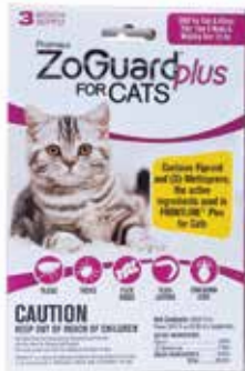
51101 ZoGuard Plus for Cats (1.5 lbs & up), 1pk